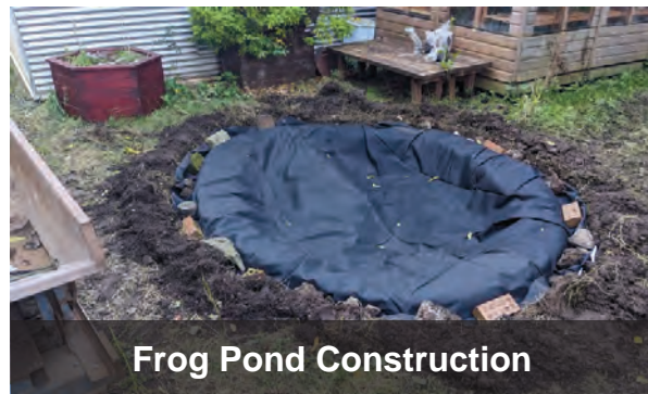
Frog Pond Construction

Science students have turned the college's own campuses into living laboratories. Habitat mapping and biodiversity surveys have documented the wildlife on our grounds, a Frog Pond has been constructed, and wildflower bulbs have been planted across sites. A collaboration with RSPB has deepened learners' conservation knowledge, and a Women in STEM workshop has brought new voices into scientific conversation.