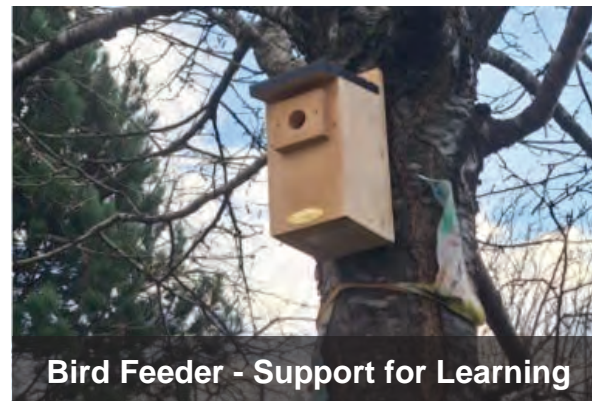
Bird Feeder - Support for Learning

gardens are thriving, upcycling craft sessions are reducing waste, and outdoor wellbeing activities are improving learner confidence and engagement, all while making Kelvin's campuses greener, more biodiverse places.