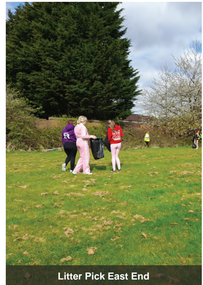
Litter Pick East End

Social Care and Humanities students are exploring the ethical dimensions of sustainability from reducing PPE waste in healthcare settings to Wellbeing in Nature walks and talks. Cultural events including International Day celebrate community diversity, and re-gifting and fundraising initiatives are putting the values of social responsibility into everyday action.