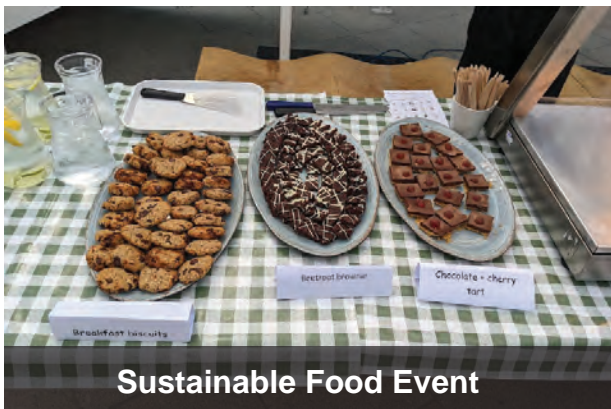
Sustainable Food Event

Learners are exploring what it means to cook and eat sustainably from planning plant-based menus using locally sourced ingredients to running workshops on food waste and ethical sourcing. The team are embedding food security into the curriculum in a way that reflects real challenges in Glasgow's communities, while cutting single-use packaging from kitchen practice across all programmes.